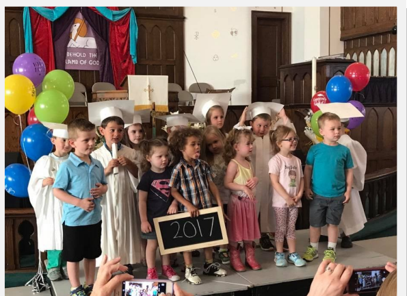
The Class of 2016-2017. We will be glad to see some of the kids back for 2017-2018.